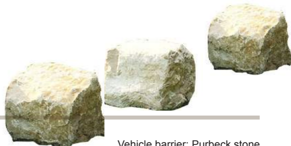
Vehicle barrier: Purbeck stone blocks, cropped finish approx. 400mm high.