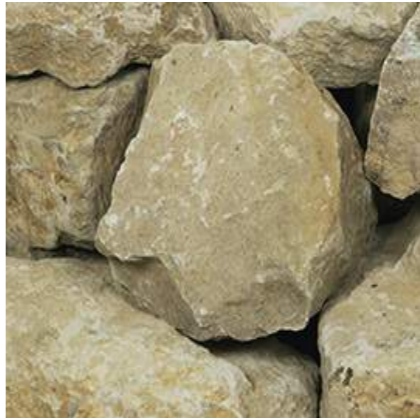
Purbeck stone for edging and lake revetment