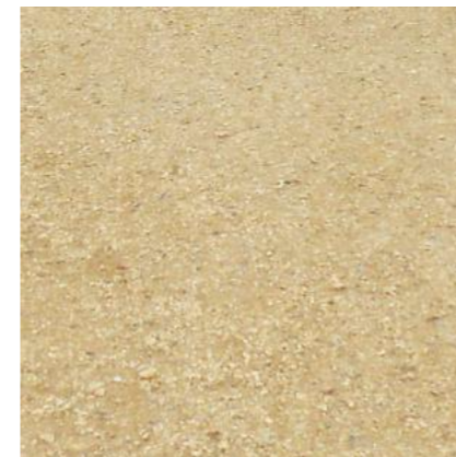
Compacted gravel surfaces