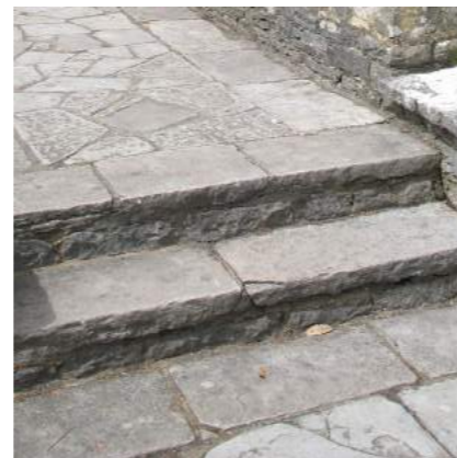
Purbeck stone - uneven finish