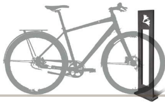
Bike stands, laser cut steel sheets. Ornamentation to reflect location, such as sports or fauna and flora in the Park.