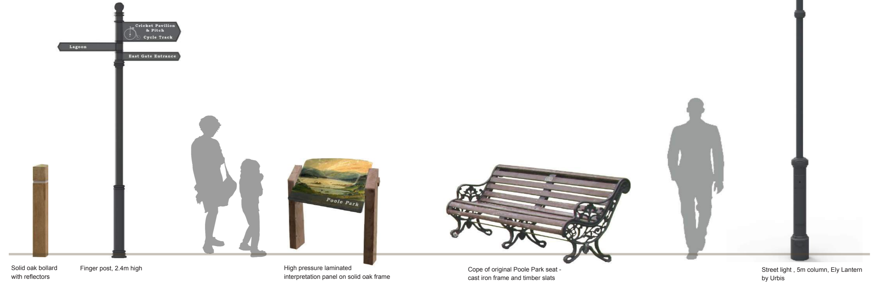
Solid oak bollard with reflectors