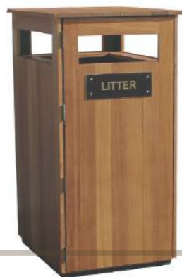
Bin housing, timber with natural finish, to receive 120l wheelie bin