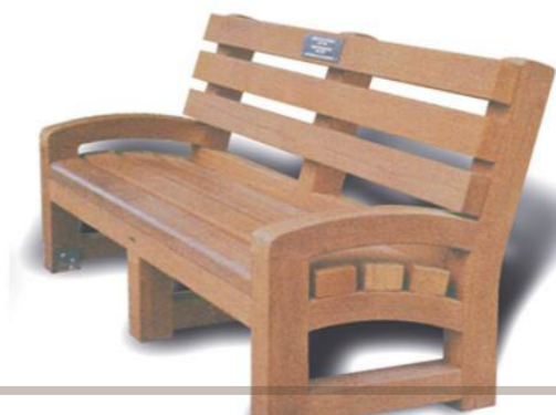
Bench: heavy durable hardwood, natural finish, back rest to be carved by artist.