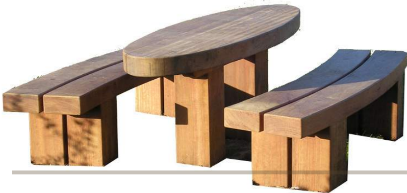
Picnic set: solid durable hardwood, natural finish