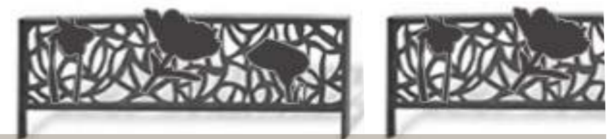
Laser cut galvanized steel barrier panels to demarcate boundary to proposed Plant Collector's Garden and replace existing timber palisade fence.