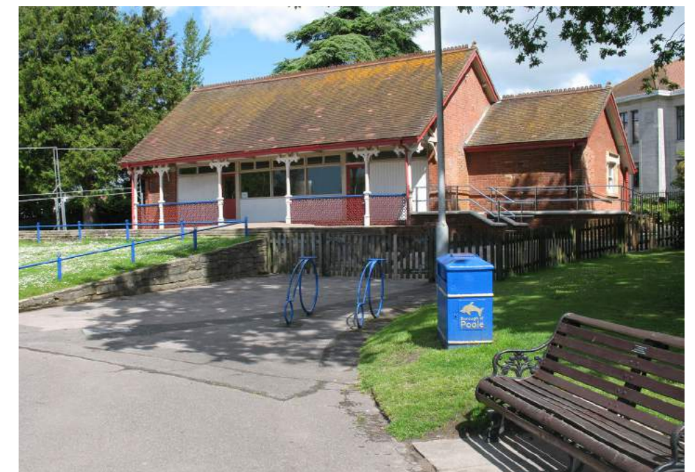
Examples of visual clutter created by the current Park's furniture and impact on the setting of historic buildings.