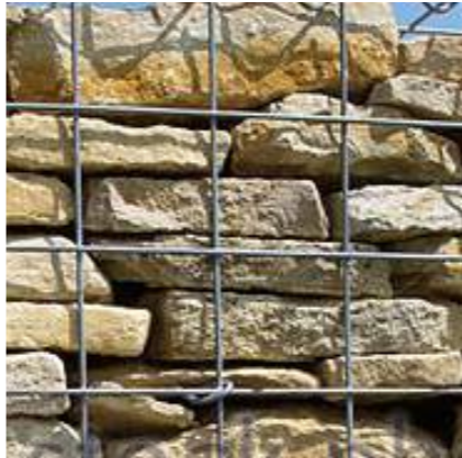
Gabions filled with Purbeck stone, random fill or hand stacked