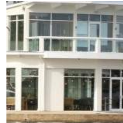
Light coloured render and detailing