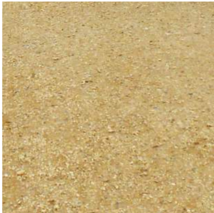
Well compacted gravel surface

The park-wide palette has been widened to include natural stone, naturally binding gravel surfaces and heavy timber seating.