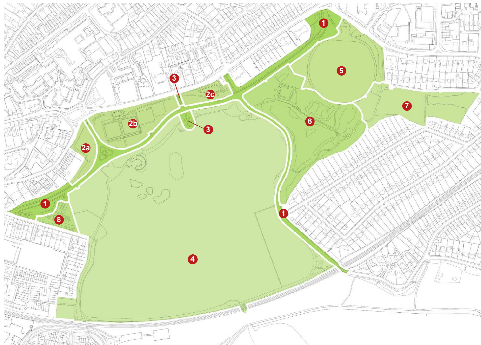
Figure X: Character Areas

A full description of each Character Area is given in the Poole Park Conservation Plan 2017.