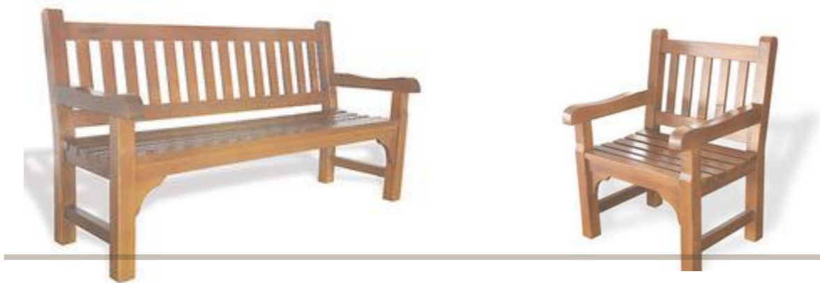
Traditional Windsor seat: durable hardwood, with high back and arm rest; double or single seat.

The Putting Green (2a) and the Rose Garden (2c) of the Northern Park Boundary are characterised by a formal parkland or garden landscape. The Rose Garden already contains Winsor style seating and it was felt appropriate to apply this seat throughout the area as an alternative to the traditional Victorian Park bench.