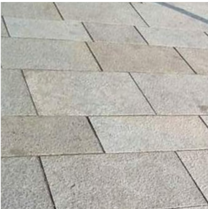
Sawn Purbeck stone paving with textured finish