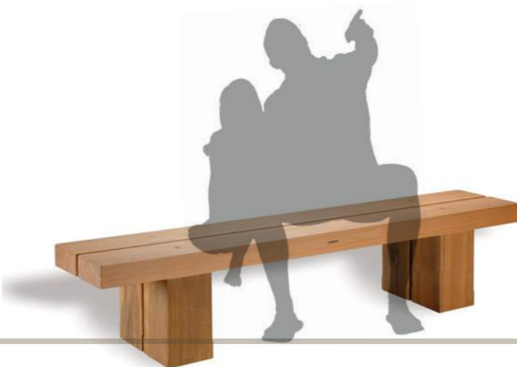
Bench: solid durable hardwood, natural finish, curved or straight, with or without back