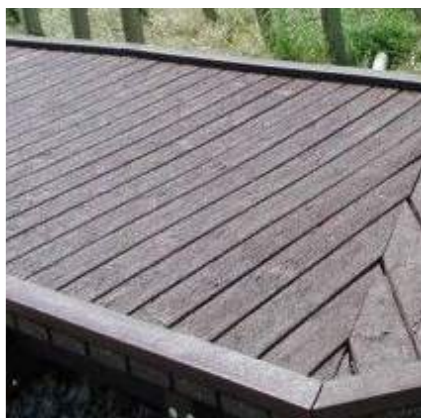
Timber composite decking board pond dipping platform