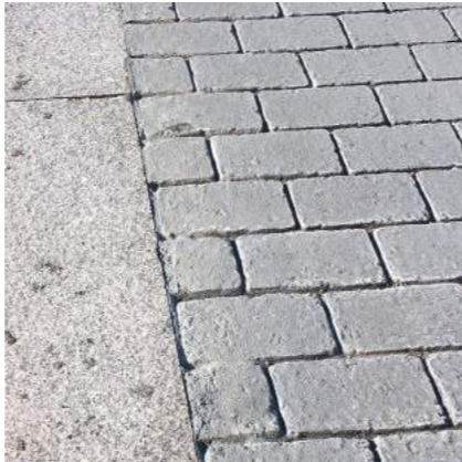
Granite kerb and imprinted tarmac with granite sett effect