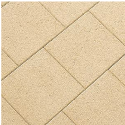
Concrete flag paving with natural stone aggregate