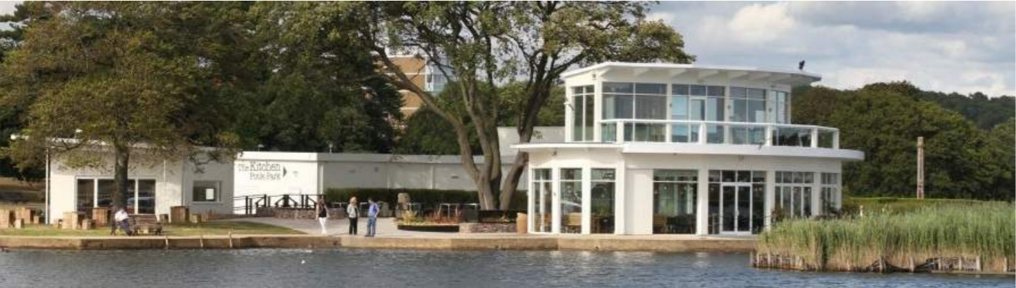
Reference images illustrating the character of the existing natural landscape and build form.