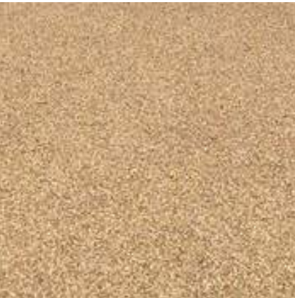
Resin bonded gravel/Tinted tarmac