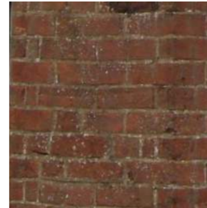
Local red coloured brick