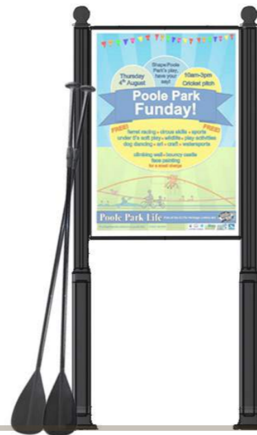
Information board with wrought iron sculptural element to reflect location, eg. oars at the landing stage nr West Field.