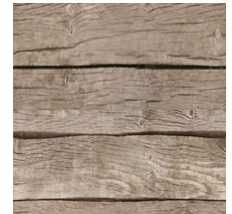
Timber in external detailing